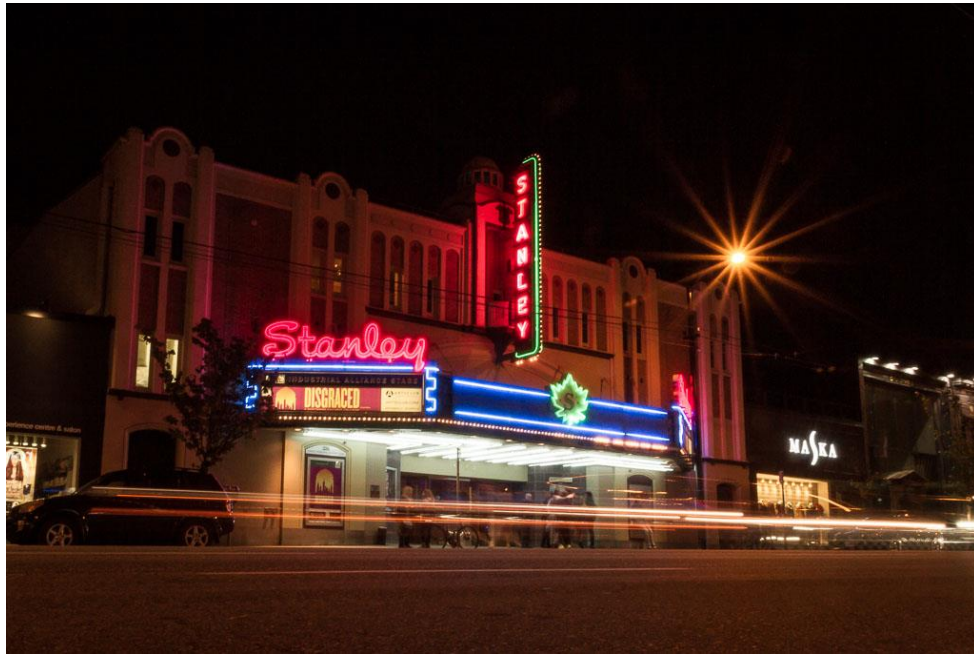
Photo of the Stanley Industrial Alliance Stage at night.

The Sound of Music is playing at the Stanley Industrial Alliance Stage, located at 2750 Granville St., Vancouver, BC. The theatre is located on the traditional, unceded territories of the Squamish, Musqueam and Tsleil-Waututh First Nations. You can see the theatre's location on the map below.