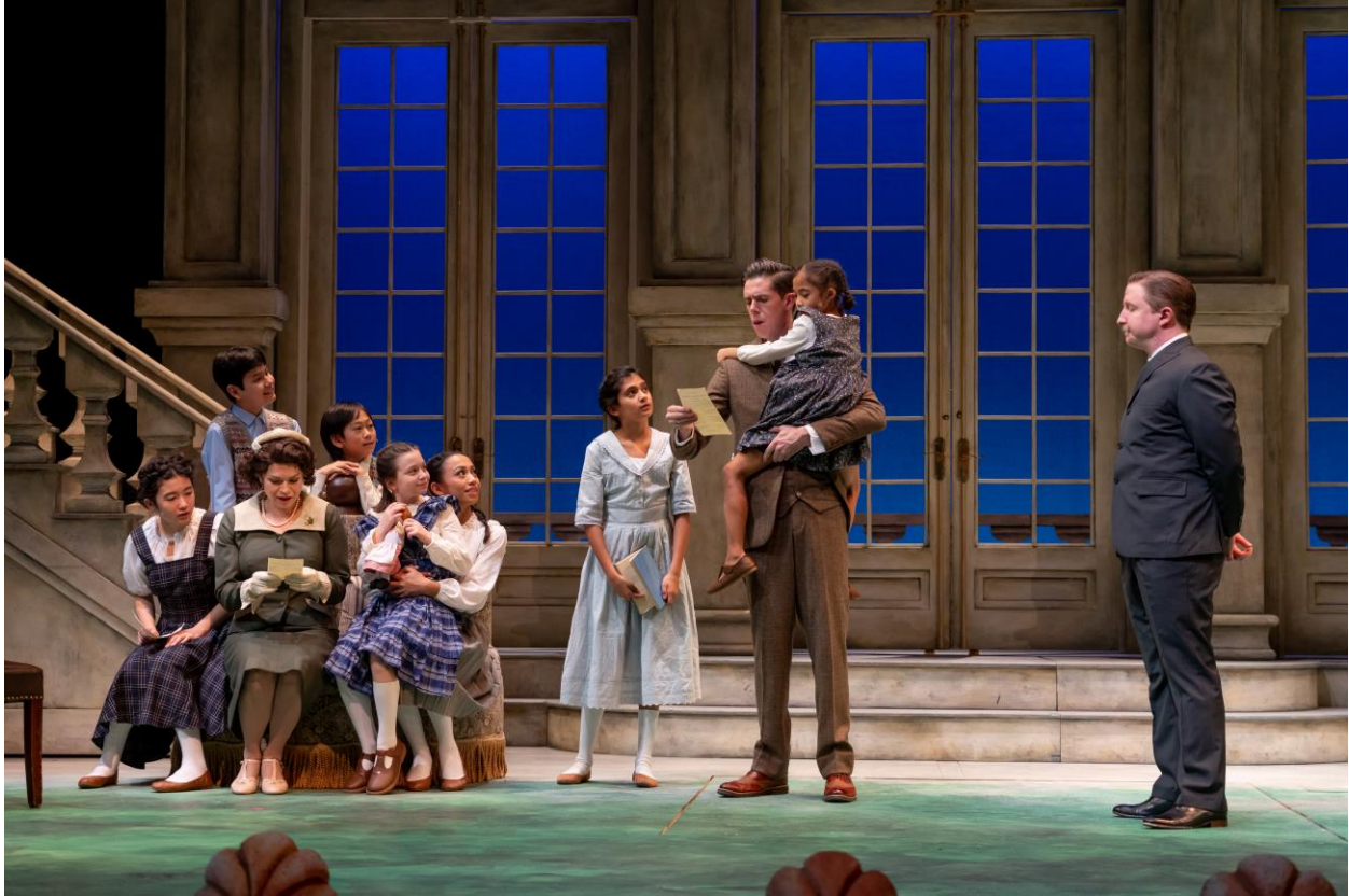
The cast of The Sound of Music