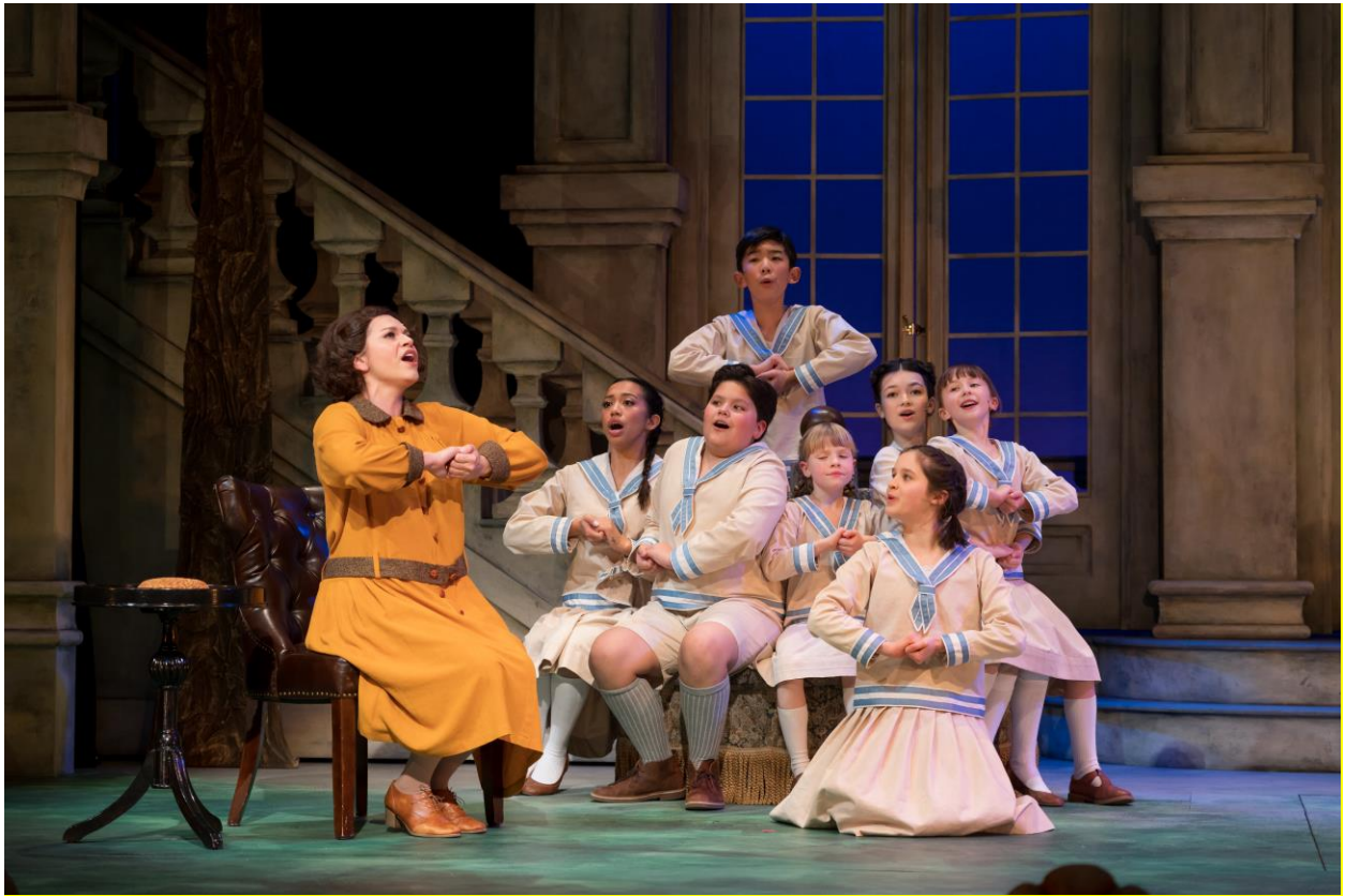
The cast of The Sound of Music

The show has two acts, it runs for 2 hours and 40 minutes and include a 20 minute intermission.