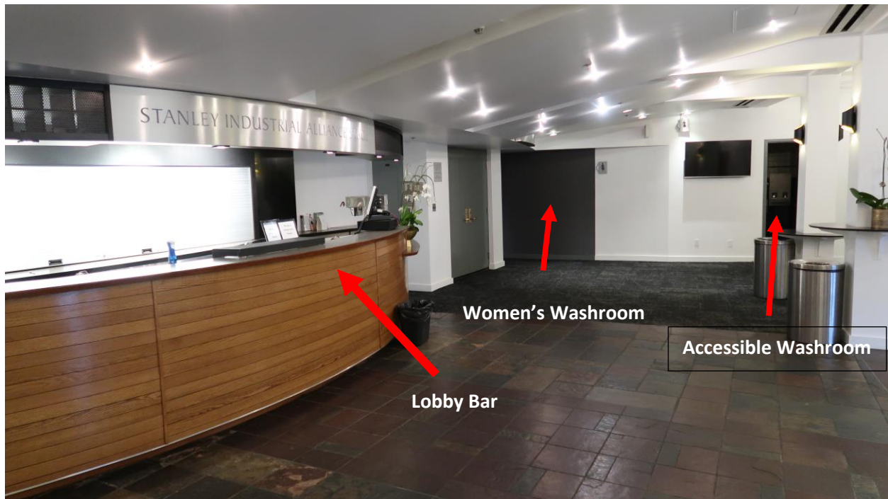
Photo of Stanley lobby

The lobby is the area where the audience waits before going into the theatre to see the show. If you would like, you can order a drink or a snack from the bar. You are also welcomed to bring your own food into the theatre.