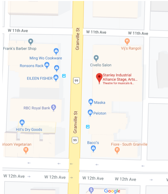
A Google Maps image of the Stanley Industrial Alliance Stage location