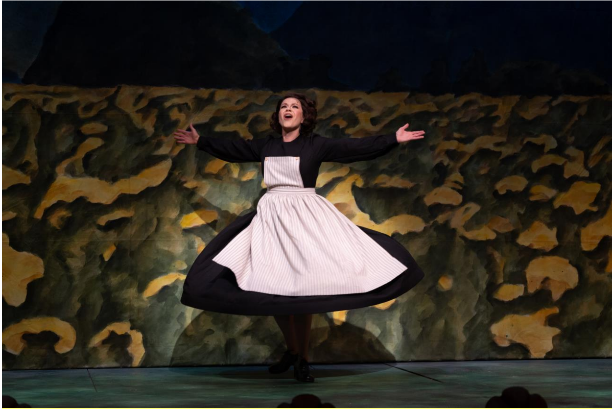
"Maria" in The Sound of Music