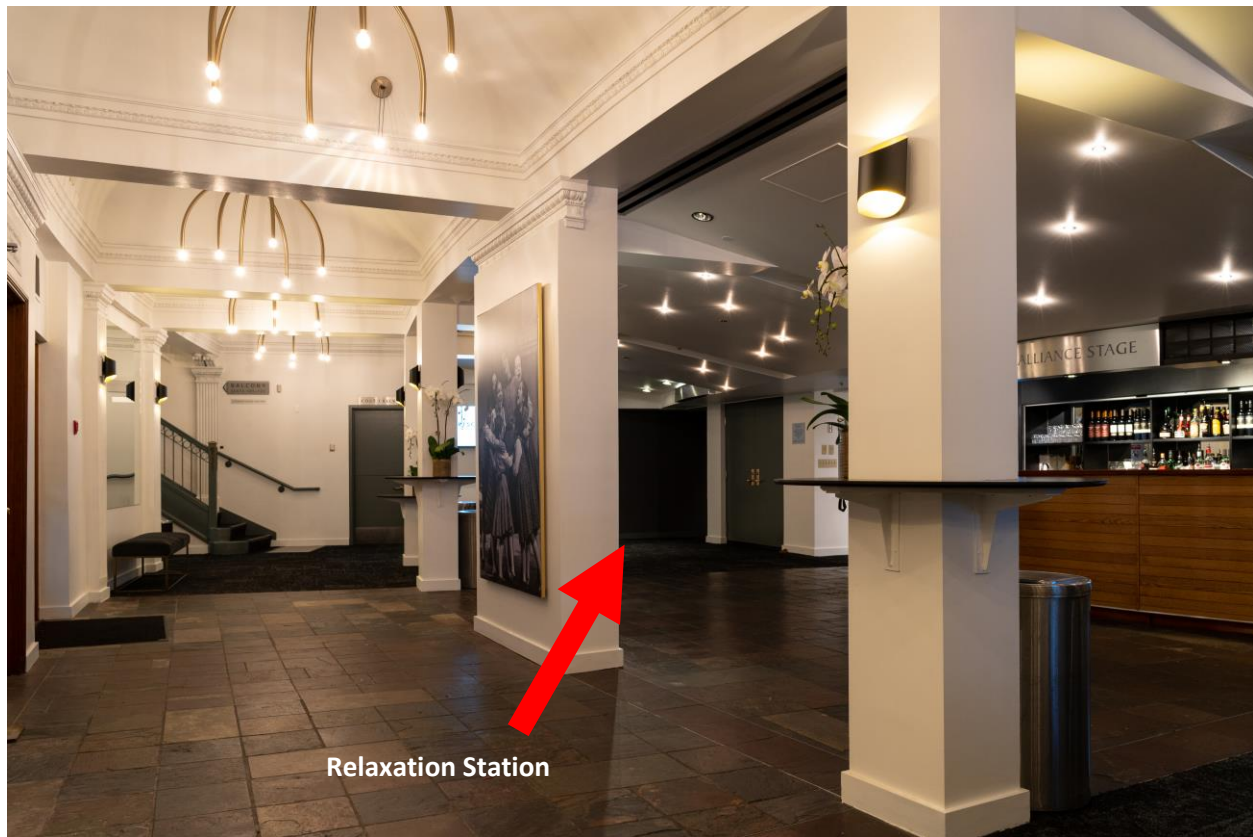
Photo of Stanley lobby