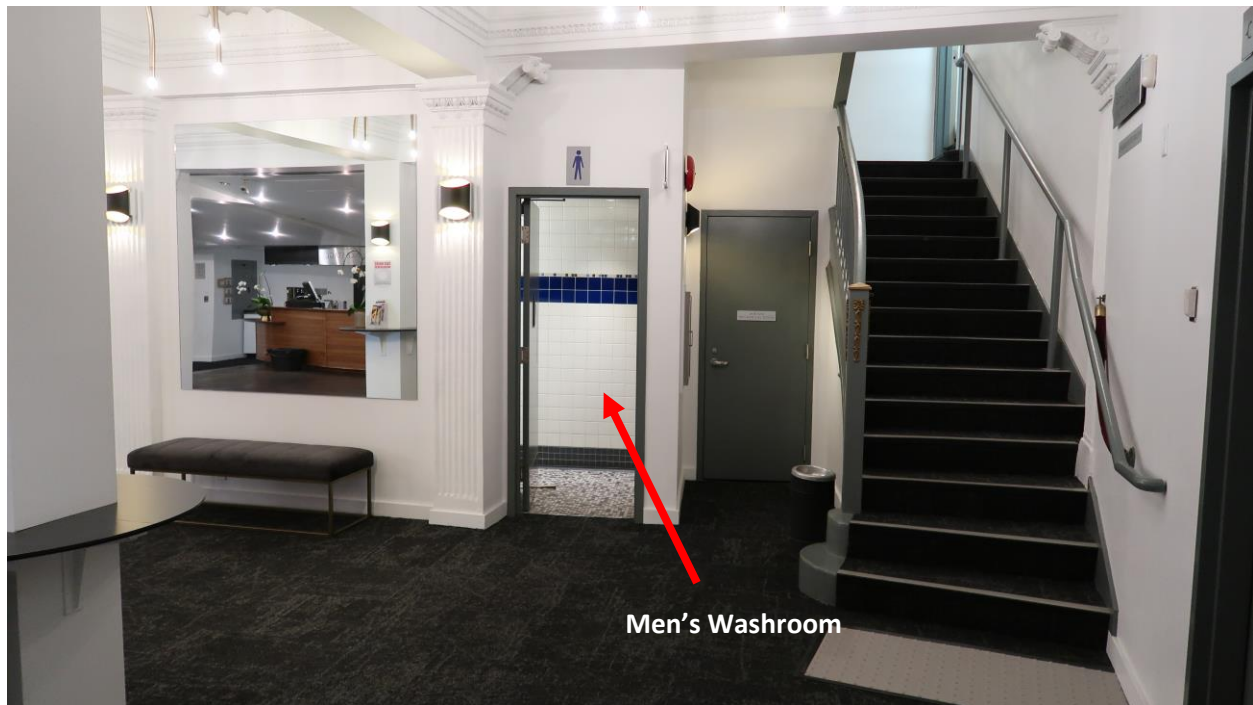
Photo of Stanley lobby