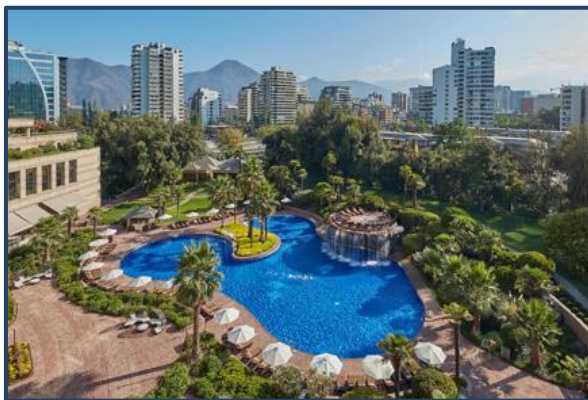
Day 3: Friday, November 29, 2024: Puerto Williams, Chile

After an included transfer to the Santiago airport and flying to Puerto Williams, enjoy the included transfer to the pier and the Silver Cloud. Puerto Williams, with a population of only some 2500 residents, is the southernmost city in the world and is on Navarino Island on the southern shores of the Beagle Channel. The surrounding scenery is magnificent with wild, windswept snow dusted mountains rising above the tree line. The city itself has the dramatic backdrop called Dientes de Navarino (the Teeth of Navarino ), which rival the famous Torres del Paine further to the north. The area was originally used by the Yaghan people who were huntergatherers enduring the harsh regional climate, but they could not weather the arrival of Europeans. The current city was established as a naval base in 1953 and honours the British-Chilean naval commander John Williams Wilson of the 16<sup>th</sup> century. Initially, the naval base served to protect territorial possessions and fishing rights of the area, as well as offering logistical support to Antarctic base, but more recently it has become a departure point for scientific and tourism trips to the Antarctic region. Puerto Williams offers a quiet relaxed experience which charms visitors with a small village feel complete with rustic buildings and the homely smell of drifting wood smoke. It's a haven of peace at the end of the world. Silver Cloud departs this evening at 9 p.m.