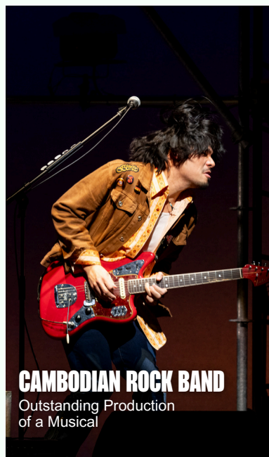
CAMBODIAN ROCK BAND

Outstanding Performance in a Comedic Supporting Role Mr. Paravicini in The Mousetrap